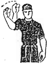
E. Strike or Out